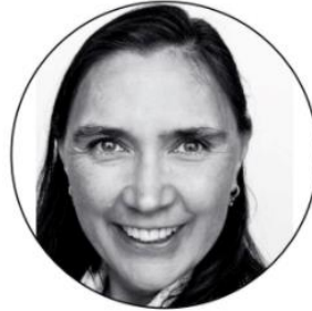
Gwen Bridge Principal Consulting Ltd.