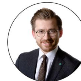
Sveinung Rotevatn Minister of Climate and Environment Norway