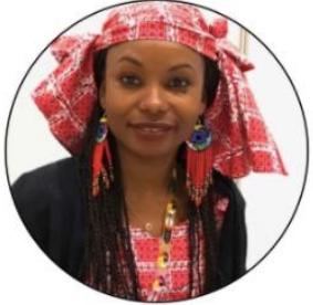
Hindou Oumarou Ibrahim